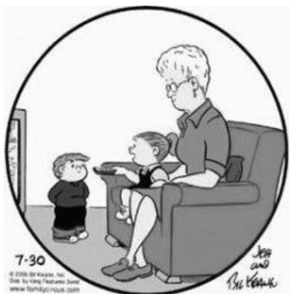
"When Grandma was young, she had to walk all the way to the TV to change the channels."

Today's Gospel from John begins a 5-week discourse about the food that Jesus gives. This Sunday we have the account of the Multiplication of the Loaves and Fish . Jesus is testing his disciple's faith! His compassionate heart says that all the people gathered on the mountain, must be fed, not only spiritually, but physically! Jesus uses what a little boy has, five barley loaves and two fish , to feed 5000 people. The little boy gave everything he had to this man, Jesus... and he ended up with more than he could ever ask for! At the end there were 12 baskets of food left over! Wow! Our God can do anything! We are now the disciples whom Jesus tells to feed the people . We must bring what we have to the Lord and allow him to transform it into more and better! We may think our faith is weak, or our love, limited... but hear Jesus say, "Take the faith you have, the love you have. Bring it to me. I will transform it. Look what I did with 5 loaves and 2 fish. Bring what you have to me. It will be more than enough, more than enough for them, and for you." What a God we have! May we allow him to use us this week... and next! And don't forget the hundreds of hungry families who rely on Project Share each day. We feed them one at a time!